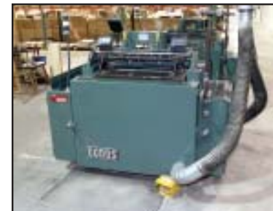
20 Spindle Alexander Dodds, Mdl. SE-20R Automatic Dovetailer, Digital Readout S/ND 93038-103