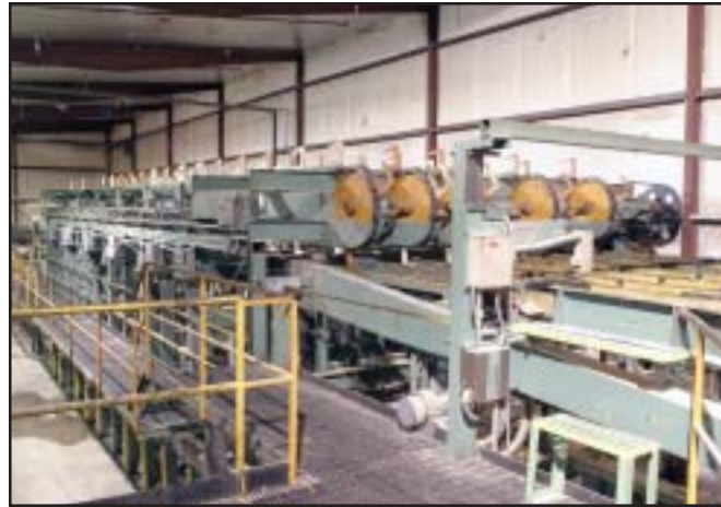
1988 16' Lerco 10 Bin Lumber Sorter, Lumber Stacker, Sticker Placer, PC Control, Width, Length, Grade, Ultra Sonic Thickness