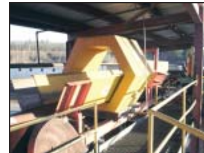
Rens Mdl. LS345, 48" Metal Detector