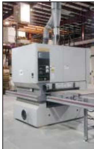
1994 Timesaver 43' Top & Bottom Sanding Line #243-41 CBT