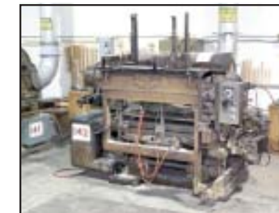
Mattison Mdl. 57F Back Knife Wood Turning Lathe, w/Extension Table