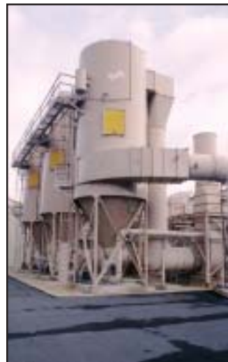
(3) 1997 Torit Donaldson #RF 60,000 CFM, 250 Hp.