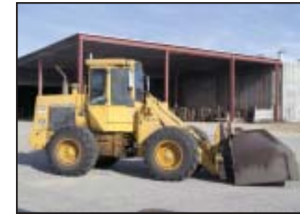
John Deere Articulating Diesel Front End Loader, Mdl. 544C