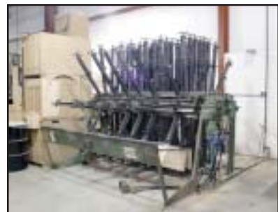
Taylor 8', 20 Section, Pneu Size 32' x 4 1/2' x 2 1/2', S/N 987