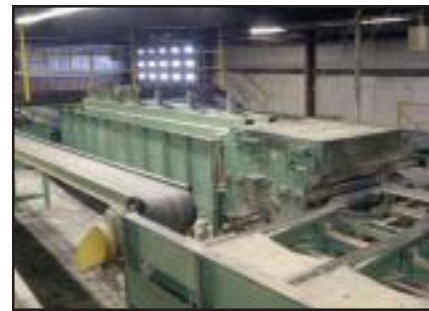
1988 PHL Single Arbor Gang Rip Edger Mdl. E6-48-2, 50 Hp., S/N 6102