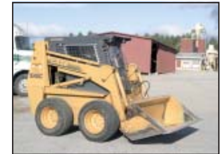
1995 Case Uniload, Mdl. 1845C, 4 Cyl. Diesel Engine, Bucket Size 6' x 2'