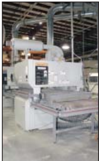
1994 Timesaver 43' Top & Bottom Sanding Line S/N 23708