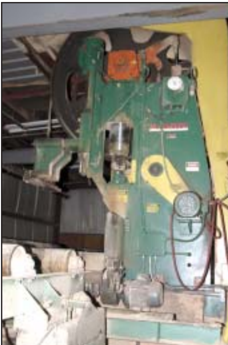
1988 McDonough 84", #8A, Twin Cut Band Mill, Right Hand, Air Strain, 200 Hp. Motor with Ramp Up Starter, S/N 84MA-159