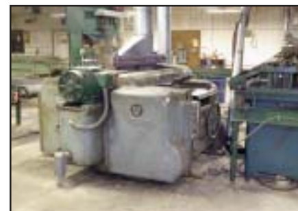
30" Whitney Dbl Surfacers, #S970, Carbide Spiral Heads, Top 30 Hp., Bottom 20 Hp. Grinding, Jointing Attach., Spprt Horse