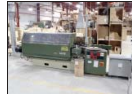
1988 SCMI Single Sided Edge Bander #B4L, S/N AN002085, REF#010422