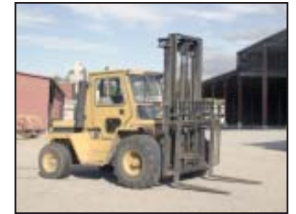
(2) Cat 8,000 Lb. Diesel Fork Lift, #R-80 Pneu Tires, Lift 168", Side Shift, S/N 49A01826, S/N 49A01860