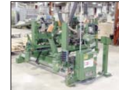
1999 Nichols Dbl Sided Feed Thru Cut-off Pocket Boring Machine, Jump Trim Hopper Feed, S/N 10-405