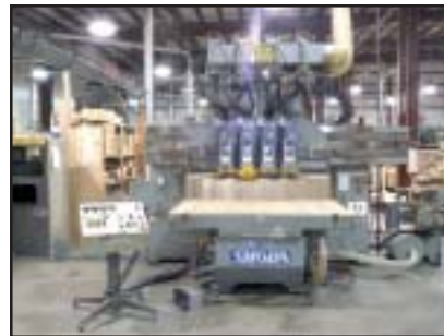
1987 Shoda 4 Hd. #NC516.1016, 39' x 62' Vacuum Bed, 11M Fanuc Control, Hi-Freq Spindles, 8.5 KW Heads, S/N 873601