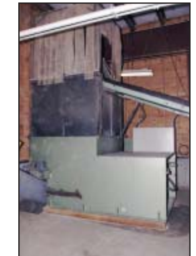
1997 Eurohansa Rotary Waste Grinder #EUR-60, 60 Hp., S/N 76018