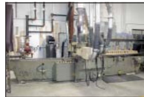
Balestrini Double Sided Profile, Shaper and Sander, Mdl. CP6, S/N M250-172