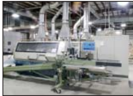
1998 Weinig 6 Hd Unimat U23, 9' x 5' Hyd #M11 Hopper Feed Grooved Bed, S/N 023-3438