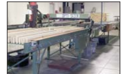
1997 Taylor 39' Opti-Sizer & Glue Spreader Mdl. 33020, S/N OS225