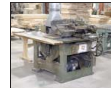
Hermance Gang Rip Saw Variable Speed, Mdl. 300G, 20 Hp.