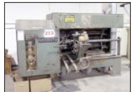
Nash 10 Spindle Sanding Machine Dust Hood Enclosure, 50" Cap. Mdl. 150, S/N 327060