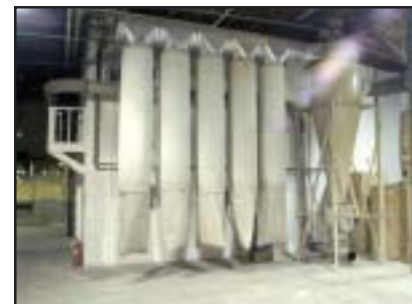
1997 Nordfab 30 Hp. 5 Bag After Filter, Rotary Air Lock