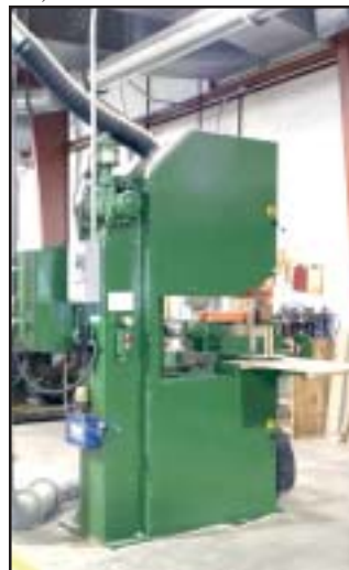
1994 Tyler Resaw, #XL3612R 2' Blade, 25 Hp., S/N 3829