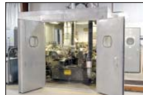
16" Woods 5 Head Moulder, Joining Attachments, Spindles 2 1/8" & 1 13/16" Mdl. 134-BM, S/N 53172