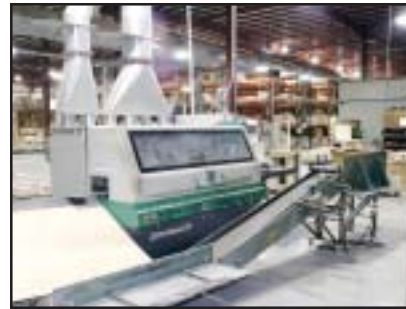
1994 Weinig 6 Hd Profimat 23, 9' x 5' Hyd #M11 Hopper Feed Grooved Bed, S/N 711-285