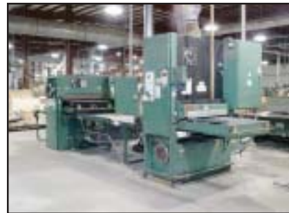
37' Timesaver Abrasive Top & Bottom Planer, Air Tracking, 100 Hp. #337-HD, S/N 10347