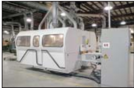
1999 SCMI 10' Dbl Sided Tenoner, Concept 2000, 1 ST Hd. Jump Scorer, 5 TH Hd. 2-Spd Sanding, PLC Opening, S/N AA110738