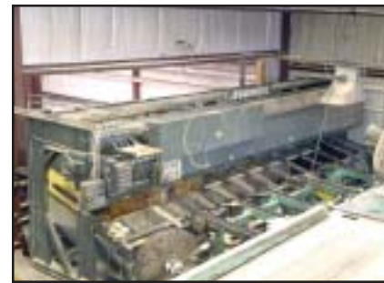
1988 Newman #KNC-24 Auto. Selective Over Head Trimmer, 8 Saw Motors