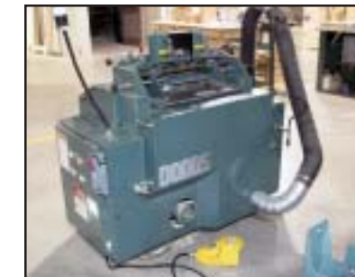
15 Spindle Alexander Dodds, Mdl. SE-15 Automatic Dovetailer, S/N D8965-117