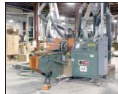
8' Merein Johnson #840 Dbl Sided Tenoner, Jump Trim Jump Cope S/N MJ 4128

More Details & Photo's Available At WWW.INDUSTRIAL-AUCTIONEERS.COM