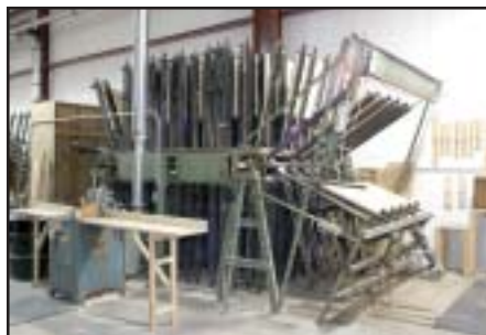
Taylor 6', 40 Section, #800081, Pneu Flattener, Wrench, Drive, S/N V-675