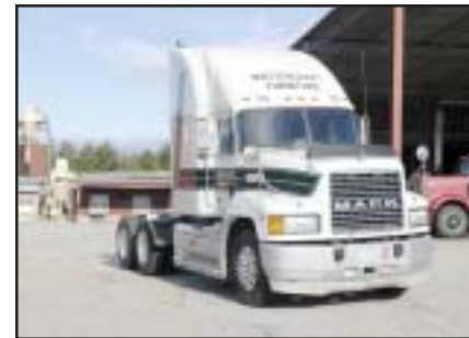
1996 Mack Tandam Axle, 6 Cyl, #CH613 9 Spd Eaton Fuller, Air Ride, 430,000 Miles