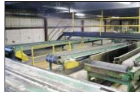
Partial View of Large Quantity of PHL Power Belt Conveyors