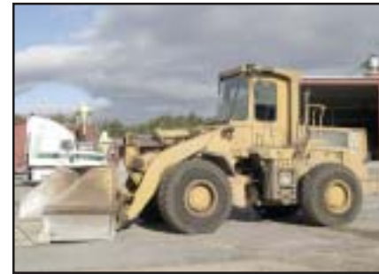
Caterpillar Articulating Diesel Front End Loader, Mdl. 950B, w/Log Loading Attachment, Hours on Meter 1,150