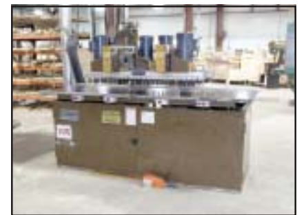
1992 Ritter Adjustable Double Line Borer, Mdl. R-52SP, S/N 1166