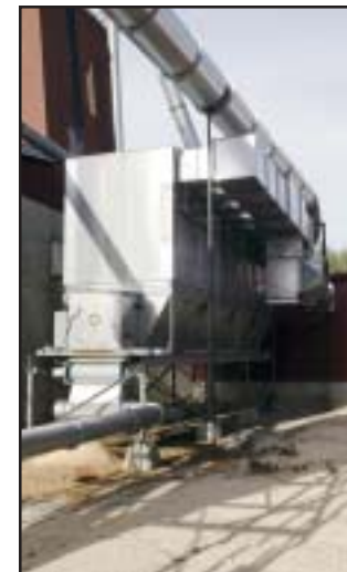
Nordfab Fine Dust Collector #NFK8HJ/1BL, 31,360 SCFM