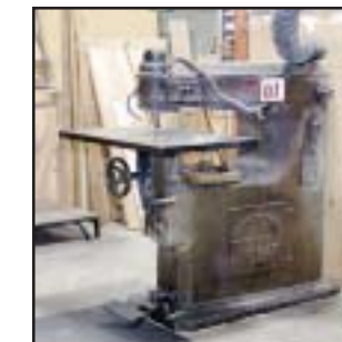
24" Ekstrom Carlson Router Mdl. 327, S/N 7044