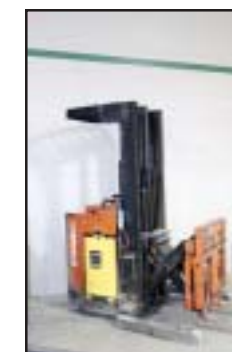
Raymond 3,000 Lb., Side Shift, Extendable S/N 021D.89.04850