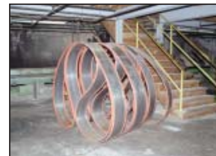
(4) 84" Twin Cut, Cut-off Replacement Blades