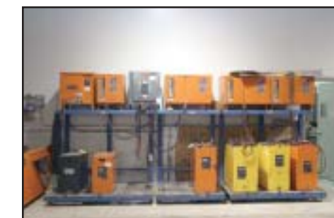
Partial View of Large Assortment of 24 Volt & 36 Volt Batteries & Chargers