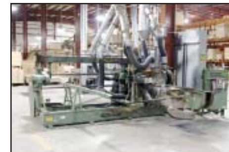
(3) 6' Challoner Double Sided Tenoner Model C527-T, Jump Dado S/N 412700, S/N 405540, S/N 405550