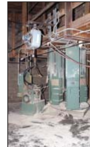
Merville 3 Station Bagger Bag Size 27' x 18' x 13'