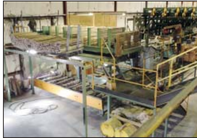
1988 16' Lerco Sticker Placer