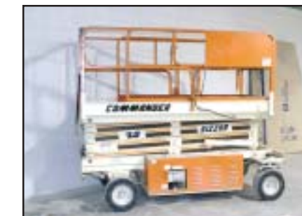
Yale 2,500 Lb. Electric Walk Behind Closed Mast 72", Max Lift 104", 42" S/N N538991