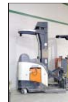
Crown 3500 Lb. Reachable Side Shift S/N 1A209214