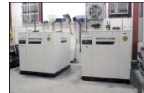
(2) 1999 Ingersoll-Rand Mdl. SSR-EPESO 50 Hp. Rotary Twist Compressor