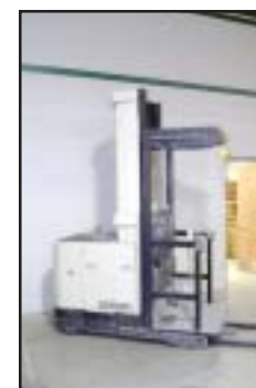
Crown Narrow Isle Electric Lift Truck