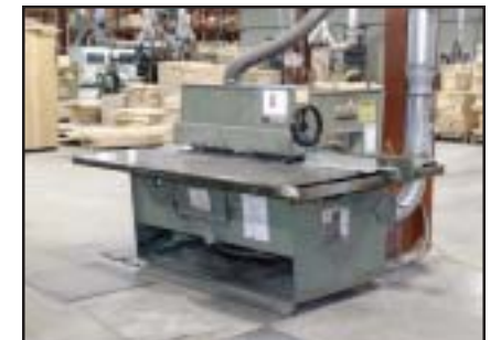
Diehl Mdl. SL-50 Straight Line Rip Saw S/N 64-M1003-325, 20 Hp