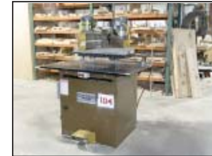
Ritter Adjustable Double Line Borer R-46, 23 Spindles Per Line, S/N 1018