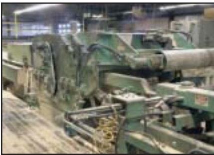
1988 PHL Dbl Arbor Gang Rip, #B8-54, Line Bar Infeed Table, Two 150 Hp., S/N S108