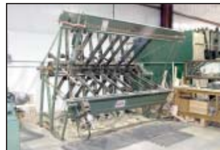
Taylor 8', 6 Section, Pneu. Flattener Wrench, Drive, S/N V-783