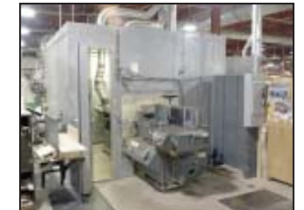
6" Diehl Push Feed 5 Head Moulder Variable Speed, w/Joining Attachments Hopper Feed, S/N 78M40553425