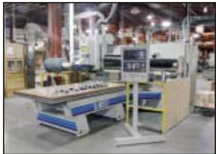
1996 Komo, #VR-108, 4' x 8', 8ATC Vacuum Bed, GE Fanuc Series O-M Control, S/N 1812696