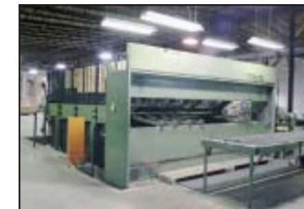
1997 10' Taylor 80 Sect, #800181, Hyd Flattener, Wrench, Dual Drive, S/N B197