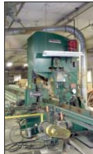
54' McDonough RH, 7" Blade 18" x 22", 60 Hp., S/N 54-1362